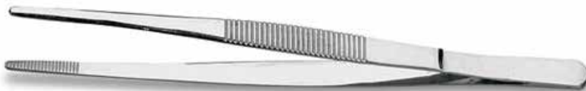
Straight - NMII35