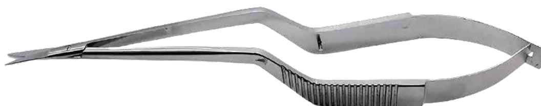
Straight - NMI134