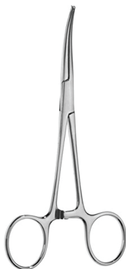
Curved 5'6'7'8 - NMII15.1