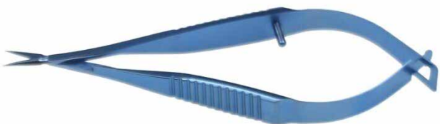
Micro Scissors Titanium