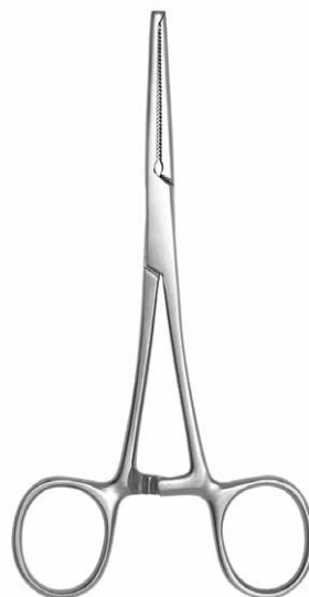
Straight 6'8'10 - NMII16.1