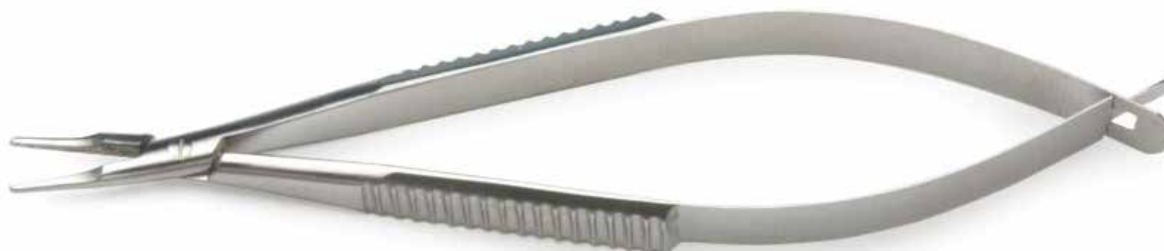
Straight - NMI132