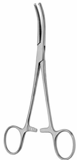
Curved 6'8'10 - NMII16.2