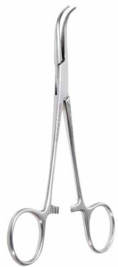
Curved 4"5"6"- NMII14.2