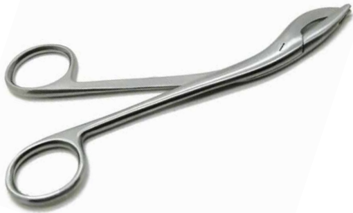
Skin Staple Remover