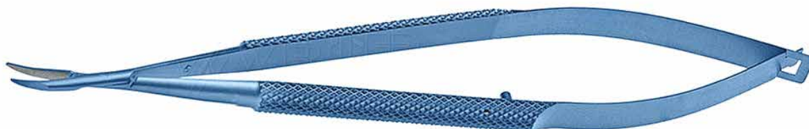
Straight - NMI133