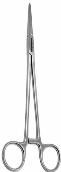
Straight 5'6'7'8 - NMII15.1